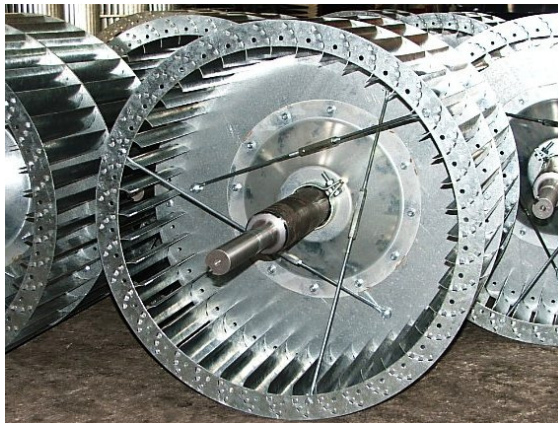
ADN-P TYPE (Double inlet with clamp type hub)