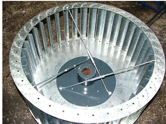
ASZ TYPE (Enforced single inlet with hub)