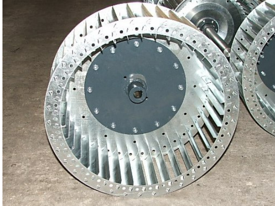
ASZ TYPE (Single inlet with motor hub)

ASZ Single Inlet, 20" to 40" Diameter, 8" to 16" Width ADN Double Inlet, 20" to 40" Diameter, 16" to 32" Width Galvanized Steel or Stainless Steel, CW or CCW Rotation