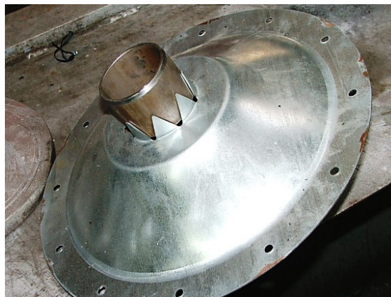
CLAMP HUB (76 or 102 or 115 mm)